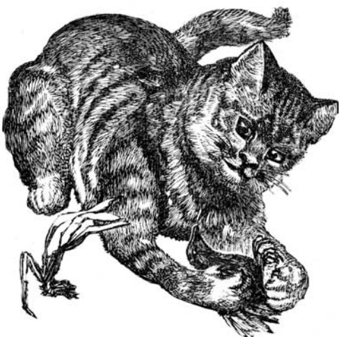
Cats cause tremendous bird mortality.

Cats. Many citizens would be surprised to learn that domestic and feral cats may kill hundreds of millions of songbirds and other avian species each year. A recent study in Wisconsin estimated that in that state